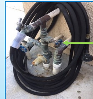
Blue knob on the right is a gate valve. Turn it clockwise to shutoff water and counter clockwise to turn water on